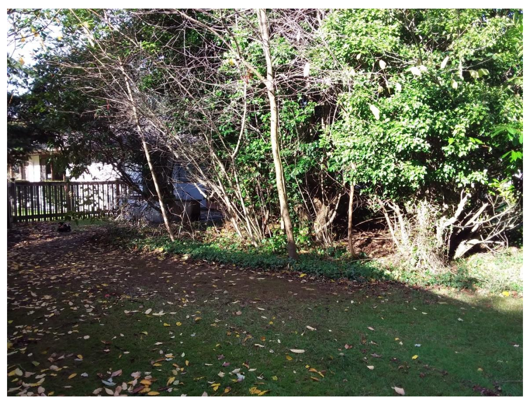
Figure 3. Looking NW at the mixed photinia and volunteer cherries along the north side of the described region.