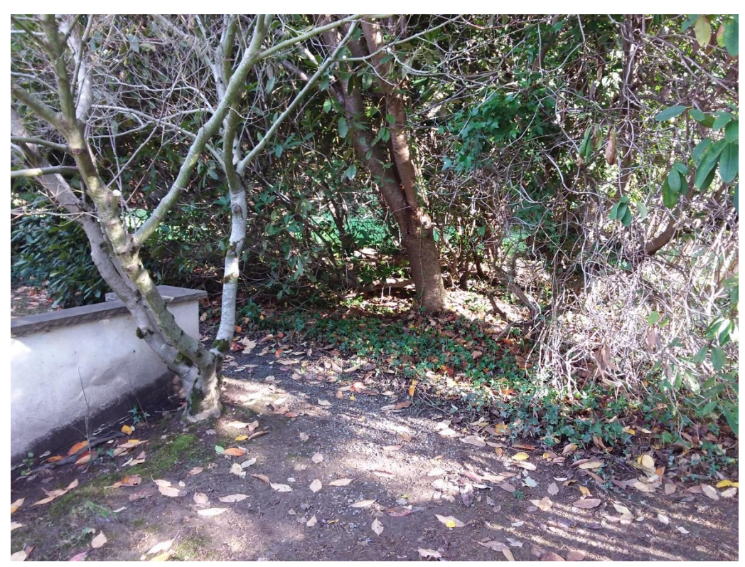
Figure 4. Looking ENE at the base of the #46 vine maple and the #45 cherry.